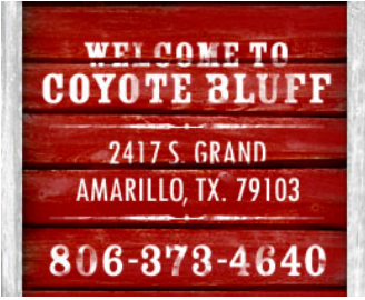
Coyote Bluff Café