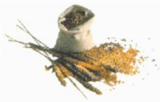
Attebury Grain, LLC